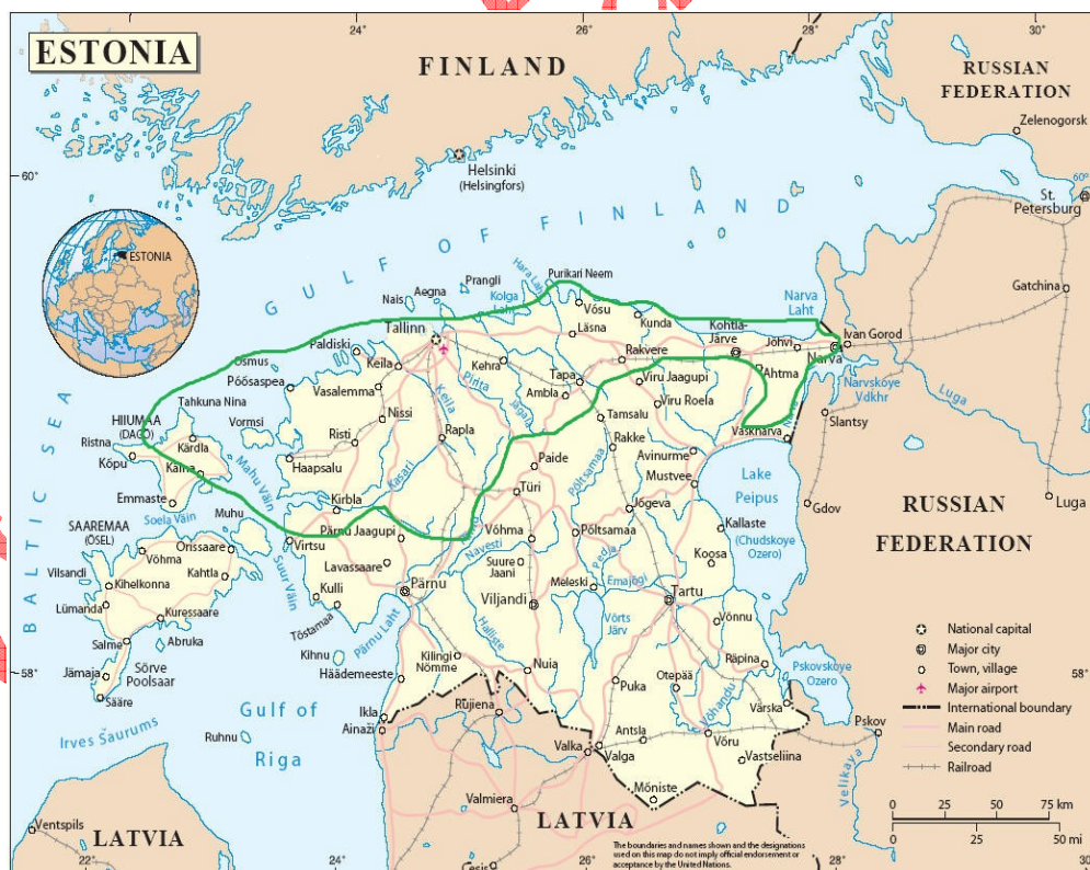
Figure 1 Freehand drawing of argillite supplies in Estonia – deposit are marked with green line .

The marine-type Estonian Graptolite Argillite ie GA (often named also dictyonema oil shale and dictyonema shale although argillite is not shale, i.e. metamorphosed clay, but just hardened clay) of an Early Ordovician age is a brown lithified claystone belonging to the formation of black shales of sapropelic origin 1 . The argillite correlates with the Ordovician Alum Shale of central and southern Sweden and belongs to the extensive formation of the Cambrian-Ordovician black shales extending from Lake Onega in the east to the Jutland Peninsula in the west. It occurs in most of northern Estonia on an area of about 11 000 km 2 (that equals approx. quarter of the republic) and the estimated reserve is 65 billion tons.