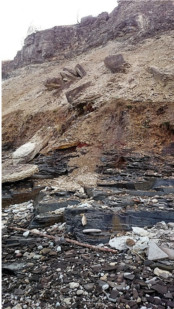
Photo 1 Klint in Paldiski peninsula