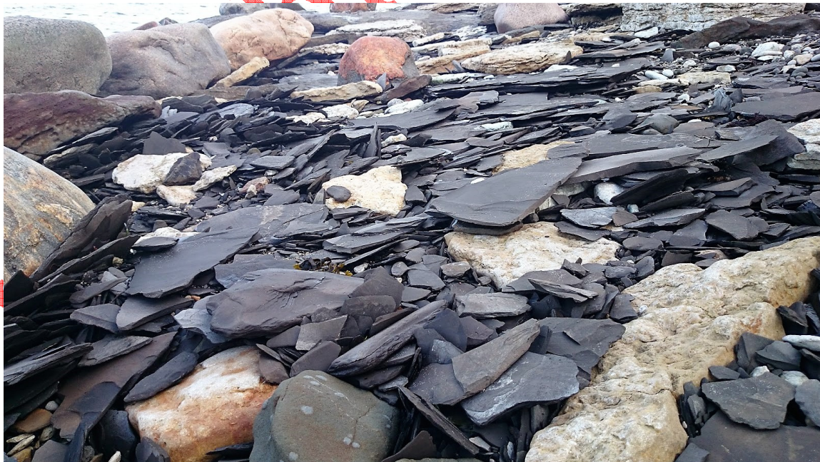
Photo 2 Black argillite sheets in Paldiski coast